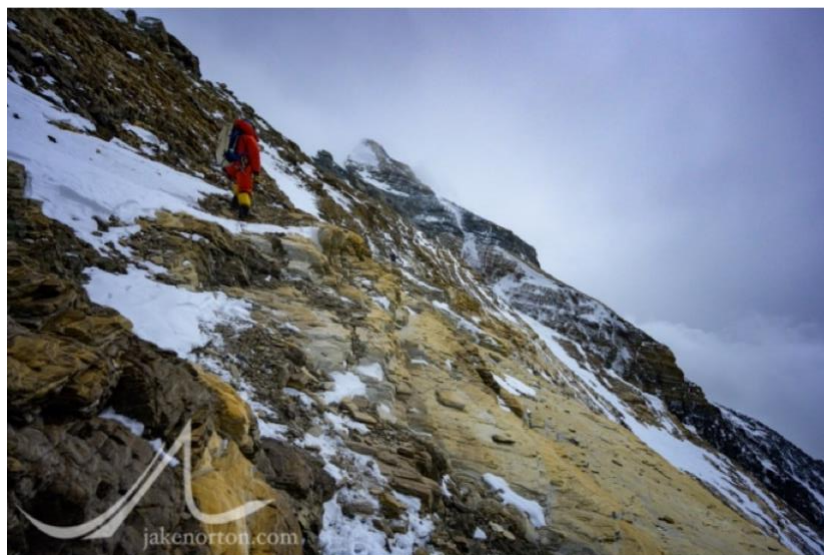
Jake Norton high on Everest's North Face

Our goal is to build a community of passionate giving – social philanthropists, business leaders, artists, entrepreneurs, mountaineers, and adventurers – to support dZi in protecting the cultural heritage and livelihoods of Nepali communities. In a world on the brink of climate destruction in geopolitical flux, new paradigms are needed to build prosperity, safeguard natural resources, and respect local knowledge.